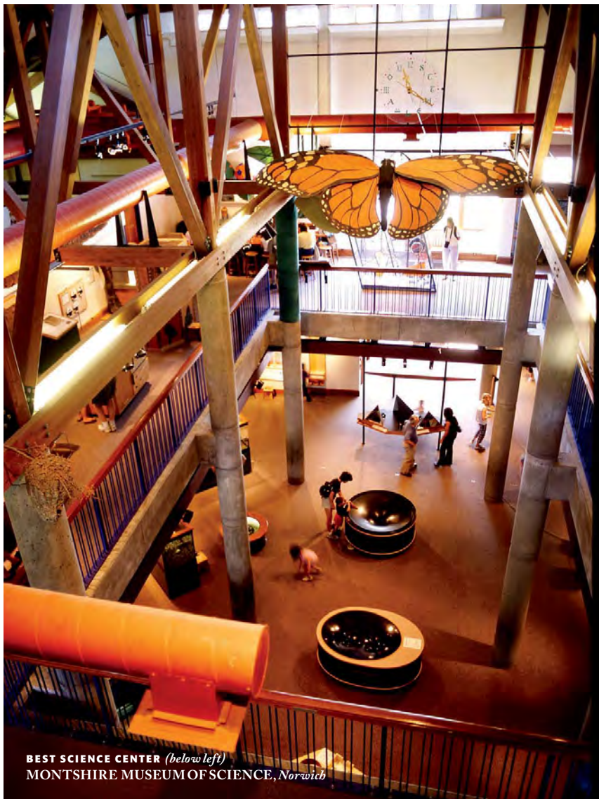
BEST SCIENCE CENTER (below left) MONTSHIRE MUSEUM OF SCIENCE, Norwich

This major science center demystifies natural phenomena, from fireflies to fog, and offers movies and images from the Hubble space telescope. Outside, explore the museum's 110 acres, including Science Park, Woodland Garden, and several miles of nature trails. Outdoor exhibits